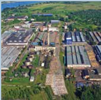
Customized Training Solutions