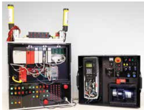
PLC and Drives Workstation