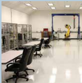
LEONI Training Center