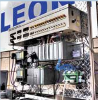
Custom Training Equipment

LEONI adapts to your specific needs. We offer a total suite of courses at our training studio in Lake Orion, Michigan, from custom courses tailored to your facility's needs and standards to open enrollment courses when you can only send a few students at a time. Or we can come to your facility and train on your equipment or on custom equipment we supply based on your production lines.