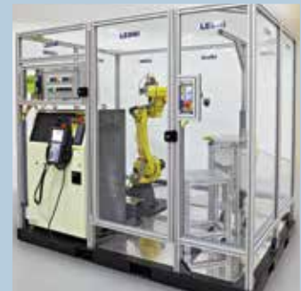
Mobile Training Workcells