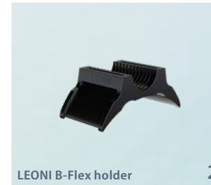
LEONI B-Flex holder 2