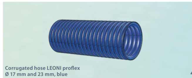
Corrugated hose LEONI proflex Ø 17 mm and 23 mm, blue 4