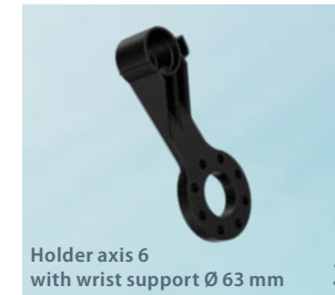
Holder axis 6 with wrist support Ø 63 mm 3