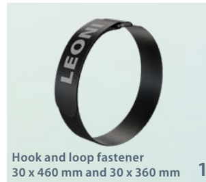
Hook and loop fastener 30 x 460 mm and 30 x 360 mm 1

Components for light weight and collaborative robots