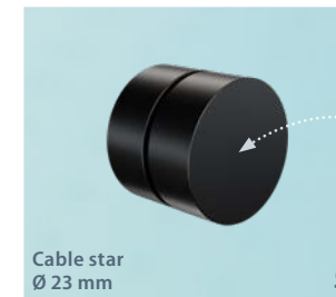
Cable star Ø 23 mm 5