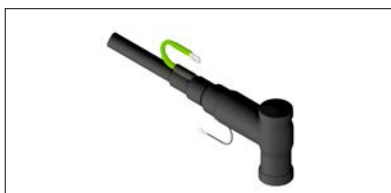
Transformer plug and over voltage arrester