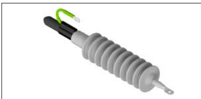
Flexible cable termination