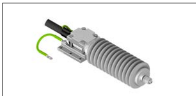
Rigid cable termination